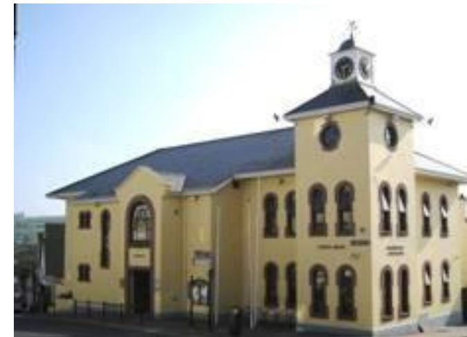
Central Library, Letterkenny.

A guide to exploring your Local and Family history with Donegal Libraries.